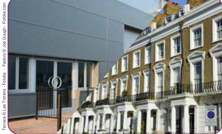
Terrace © Lee Torrains - Fotolia - Factory © Joe Gough - Fotolia.com

A more recent area that needs looking at is that if you use a wireless broadband connection, you must use password protection. If you do not, anyone can link in to your home network and not only ‘steal’ the internet access you are paying for, but also look at your files, banking details and other information, in order to defraud you.