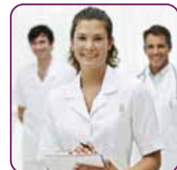
Protection in a recession