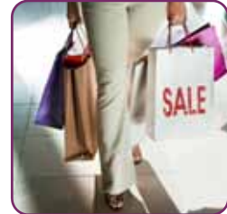
Shopping can help!