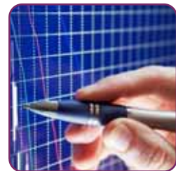
Turning a loss ...