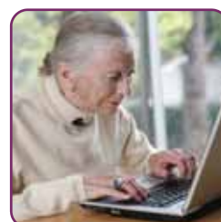
Working later in life?