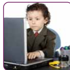
Helping future generations