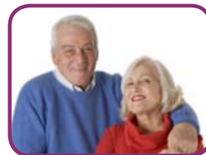
Later retirement looms