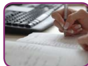
Self-certification to end